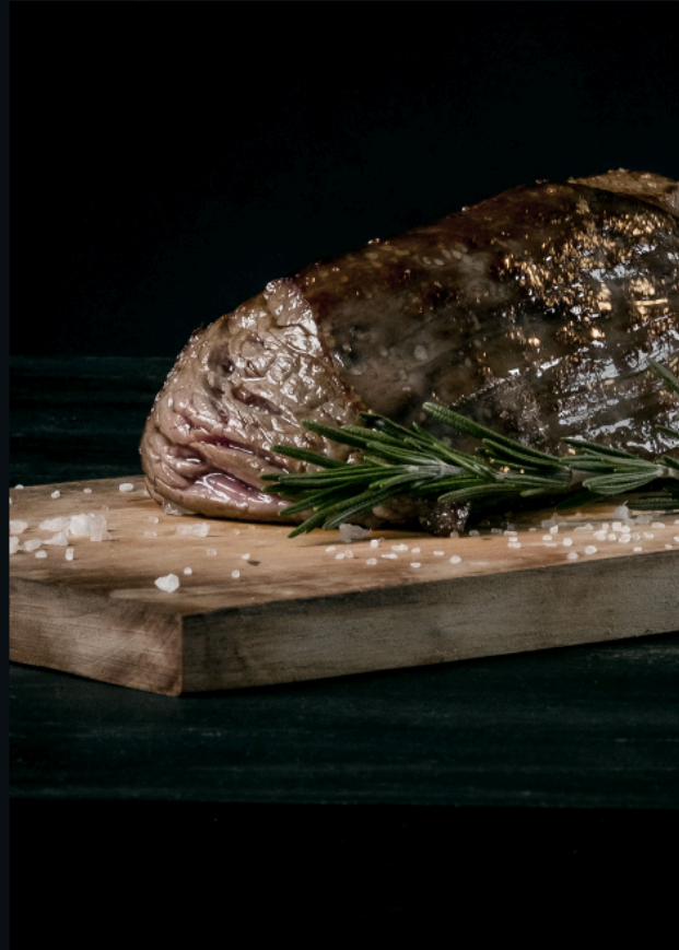
MAIN COURSES Specialties